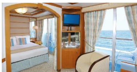
迷你套房 Junior Suite