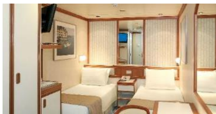
內艙艙房 Inside Cabin /