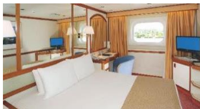
海景艙房 Outside cabin