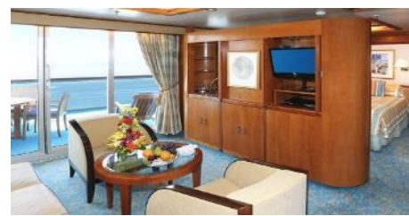
Balcony Suite 露台套房